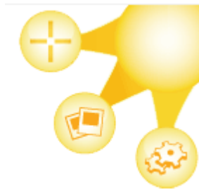
Figure 2: Example of Jing sub-circles NOTE: This will appear differently on-screen depending on where you place it your screen's edge! (Top: Capture, Center: History, Bottom: More)